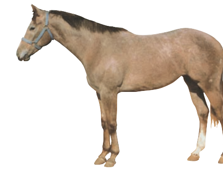
MARKINGS: Right hind stocking. Dark spots on right hind coronet. (Note that in this horse, the gray characteristic is superimposed over a basic sorrel or chestnut color, making this a gray horse. It is a common characteristic of gray horses to have patches of concentrated white hair which are not objectionable providing there is dark skin underlying the patches.)