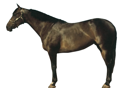
MARKINGS: Right fore pastern white

Brown: Body color brown or black with light areas around muzzle, eyes, flank and inside upper legs; mane, tail and points black.