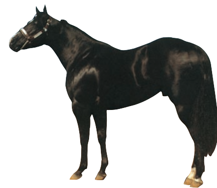
MARKINGS: Star. Left hind half pastern white. Right hind sock.

Black: Body color true black without light areas; mane and tail black.