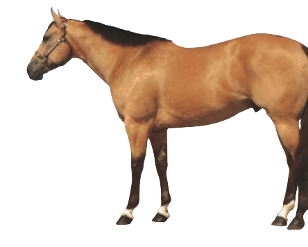
MARKINGS: Fore pasterns white. Right hind sock.

Buckskin: Body color yellowish or gold; mane and tail black; usually black on lower legs. Buckskins typically do not have dorsal stripes.