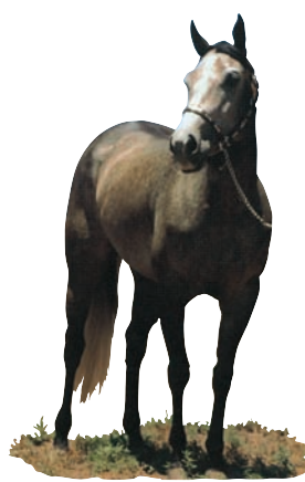
NO MARKINGS: (A relatively young horse with the graying effect most predominant on its head - note that on roan horses head and lower legs remain dark though body is roaned.)

Gray: Mixture of white with any other colored hairs; often born solid colored or almost solid colored and gets lighter with age as more white hairs appear; may have dorsal stripe.