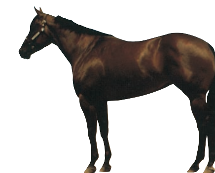
MARKINGS: Left hind coronet white.

Bay: Body color ranging from tan, through red, to reddish-brown; mane and tail black; black on lower legs; may have dorsal stripe.